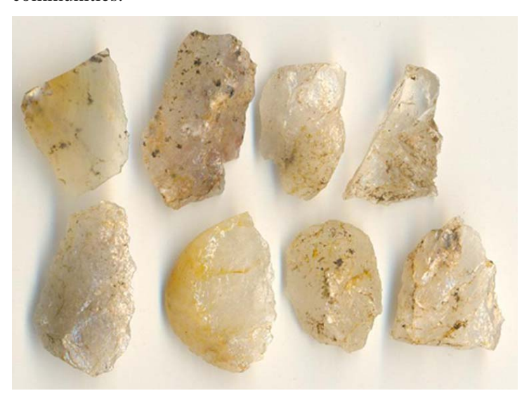
Fig. 3. Later Stone Age Quartz Microliths

Overall and in terms of archaeological records, excavations of trench 1 and trench 2 carried out in the Lumbi site has evidenced the presence of microliths artefacts. These are clear evidences that the site was occupied by the Late Stone communities; these could have been Neolithic communities.