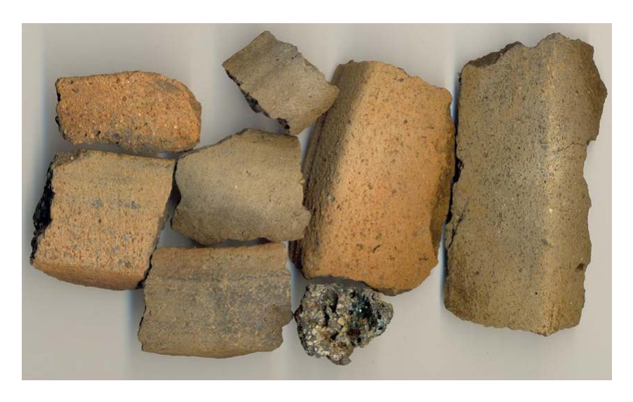
Fig. 4. Fluted Ceramics ("Matola" Tradition) and Iron Slag