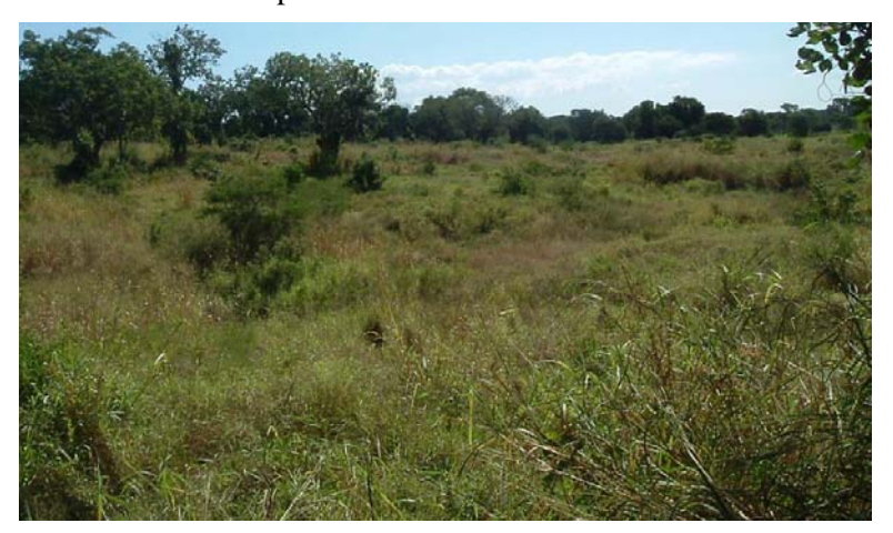
Fig. 2. General View of Lumbi Site; Marromeu District (Sofala Province)

At Lumbi there are evidences of occupation by late stone-age communities and farming communities in the past.